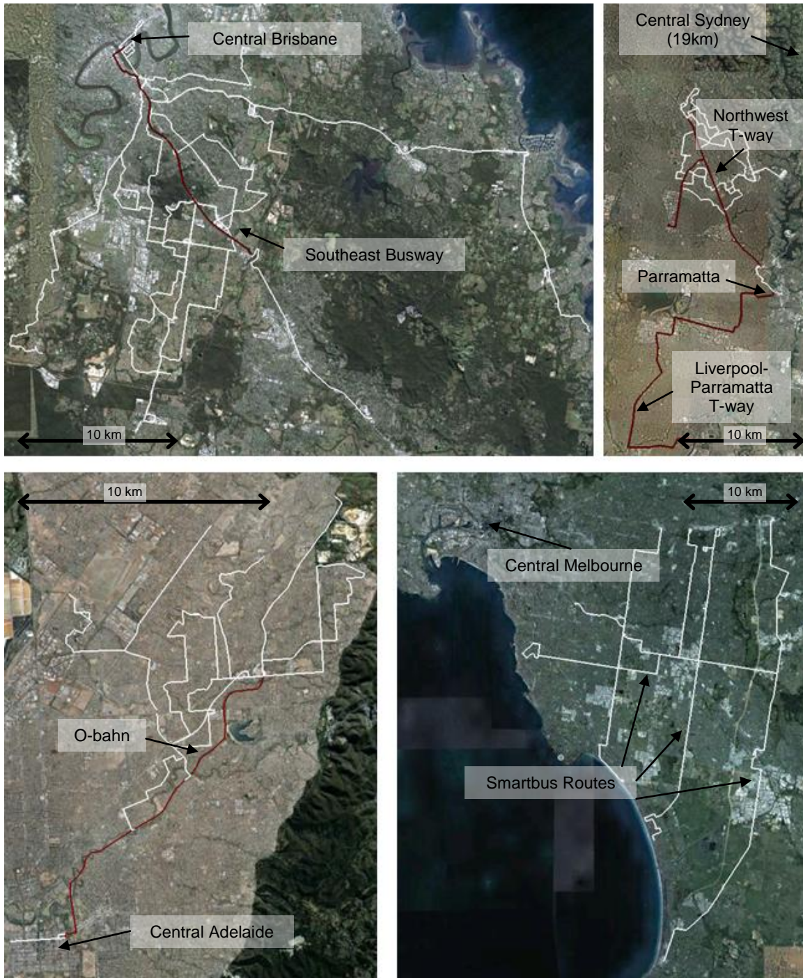
Figure 1: Maps of BRT systems in Brisbane, Sydney, Adelaide and Melbourne

Note: Dark red lines represent busways whereas white lines represent on-street running. Melbourne map only shows Smartbus routes for ease of interpretation