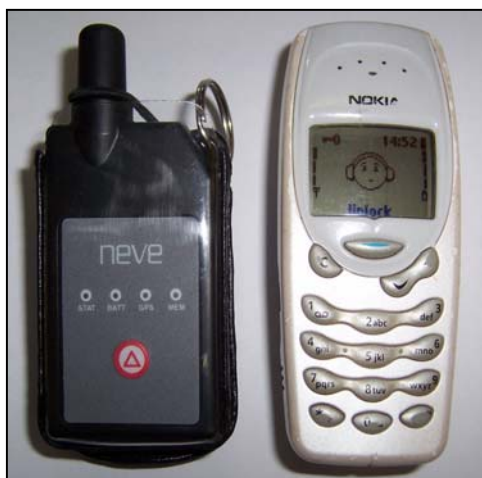
Figure 1: The NEVE ®1 passive personal GPS loggers used by ITLS in comparison to a standard NOKIA ® phone